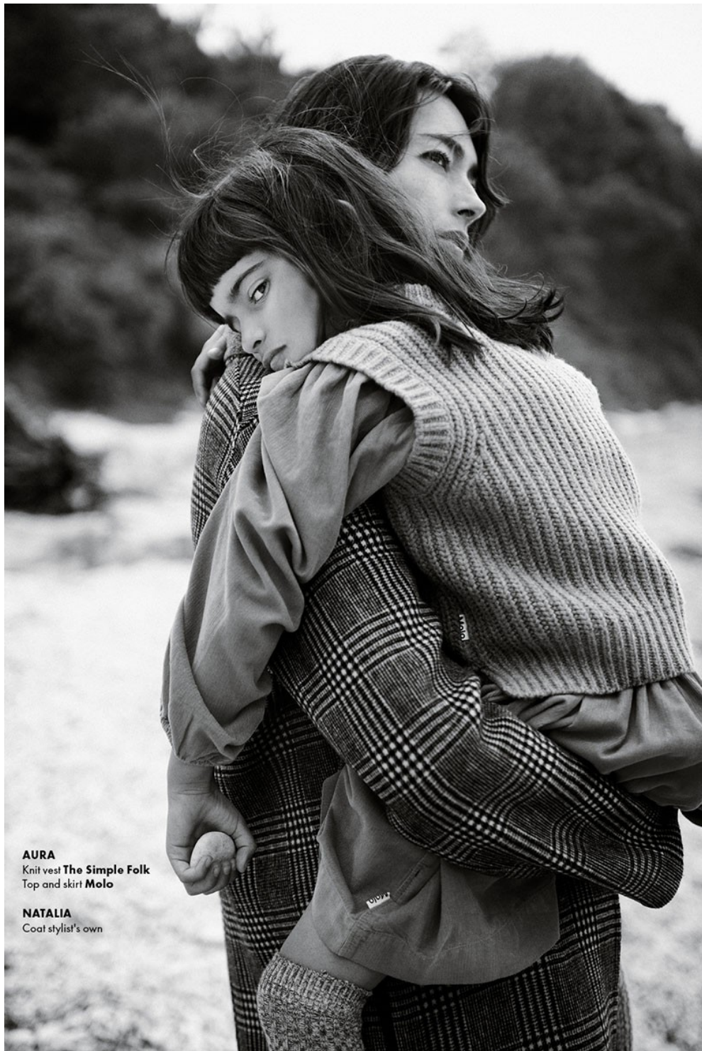
AURA Knit vest The Simple Folk Top and skirt Molo