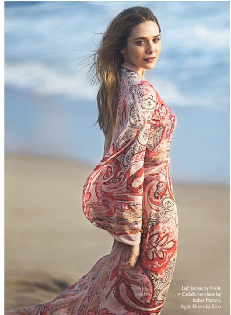
Left: Jacket by Fendi + CellaB; necklace by Isabel Marant. Right: Dress by Etro