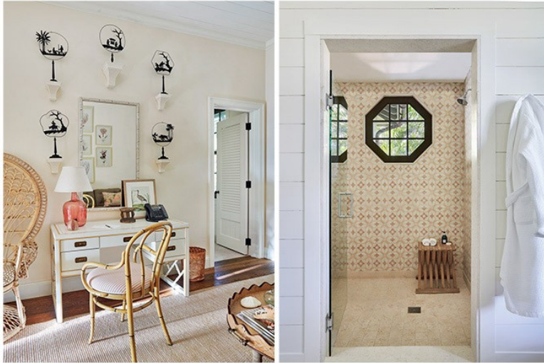
ABOVE LEFT An anachronistic but useful boudoir is adjacent to the master bedroom. It's decorated with a set of antique fan frames, most likely from Indochina. The intricate silhouettes tell entire Kara Walker-like stories. ABOVE RIGHT The baths were all "color coded" with unique tonal combinations in the same patterned tile. BELOW AND OPPOSITE Another wing contains a feminine suite of rooms for the girls in the family. The twin beds were painted white and, in a divergence from the Indian theme, the mirrors are Mexican tinwork studded with turquoise stones.