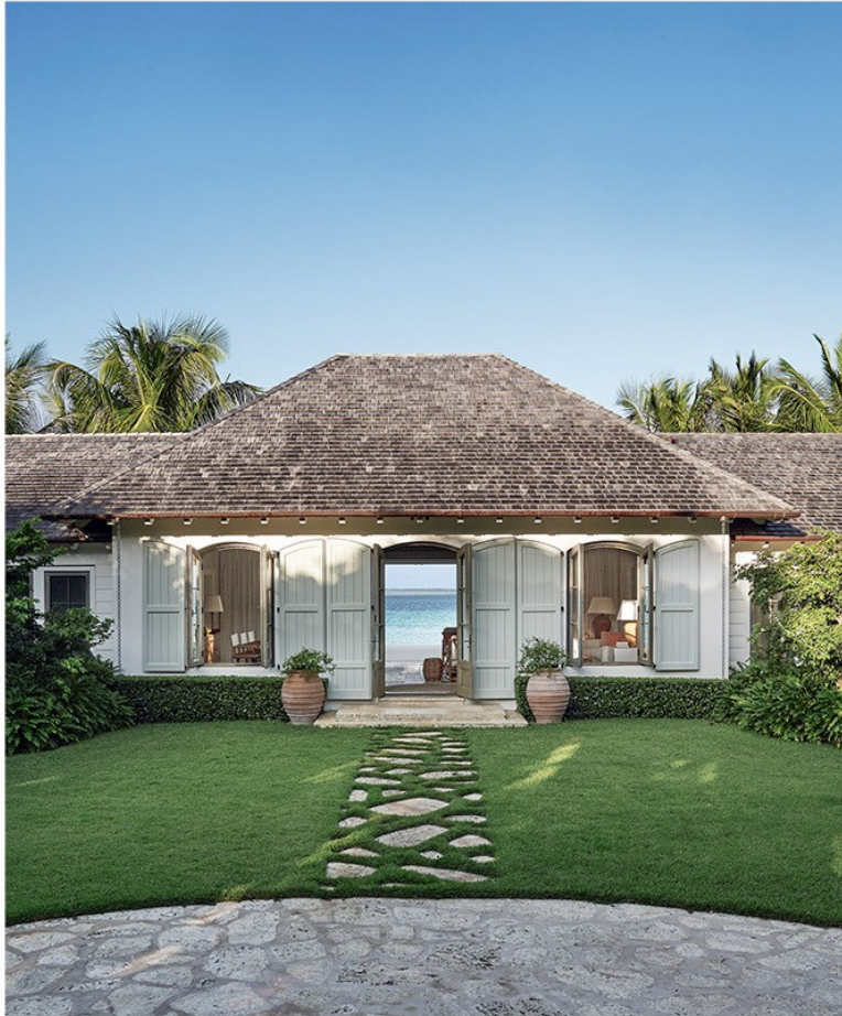
ABOVE The "little house" facing the bay at the western end of the property serves as a guesthouse. A swimming pool and a dock populated with boats for fishing and other watersports compete with the lovely prospect of dolce far niente . OPPOSITE Masonry banquettes fitted with cushions bring a hint of Cape Dutch style to the terrace.