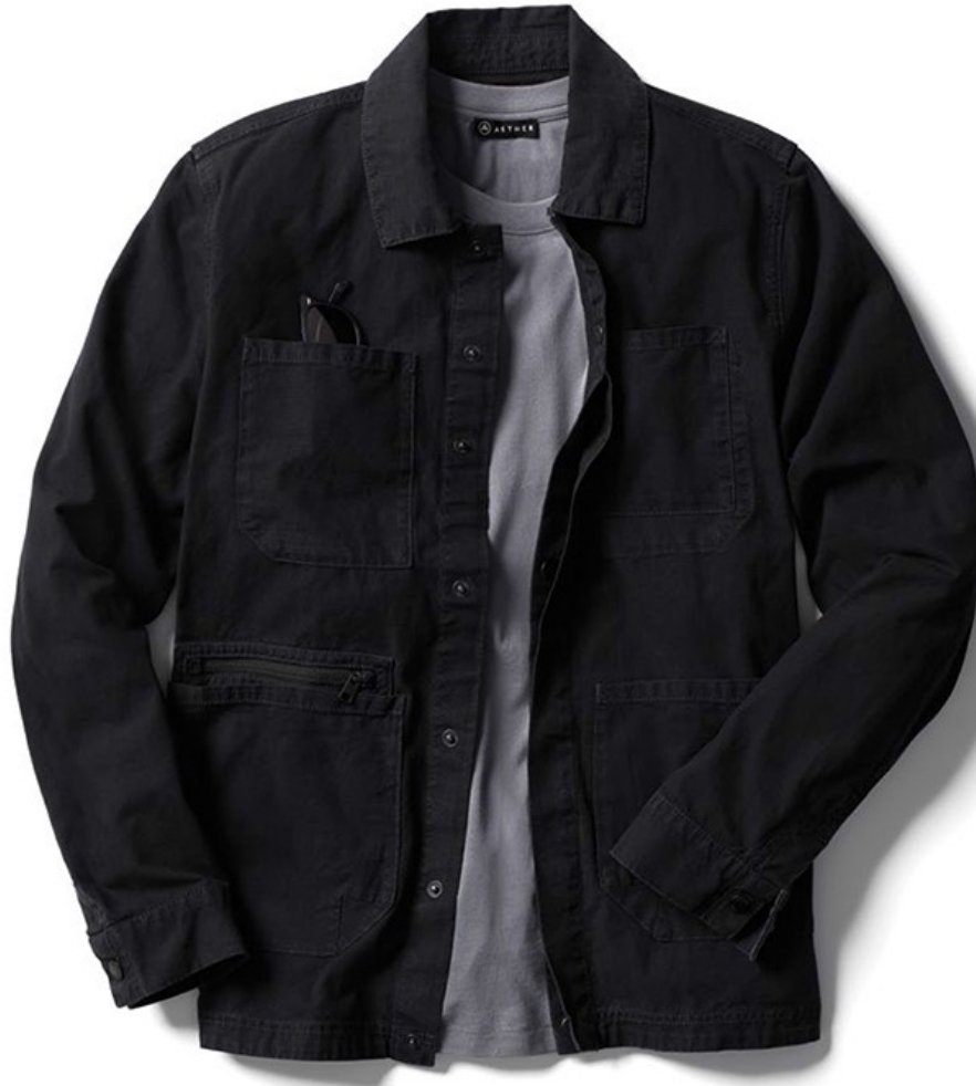
Morro Jacket, $195; Crew Tee, $45.