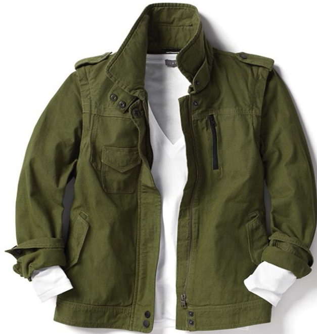
Sahara Jacket, $225; Ideal V-Neck Long-Sleeve Tee, $85.

Two pieces in one, the Sahara Jacket features removable sleeves, giving you multiple options in warm-weather style.