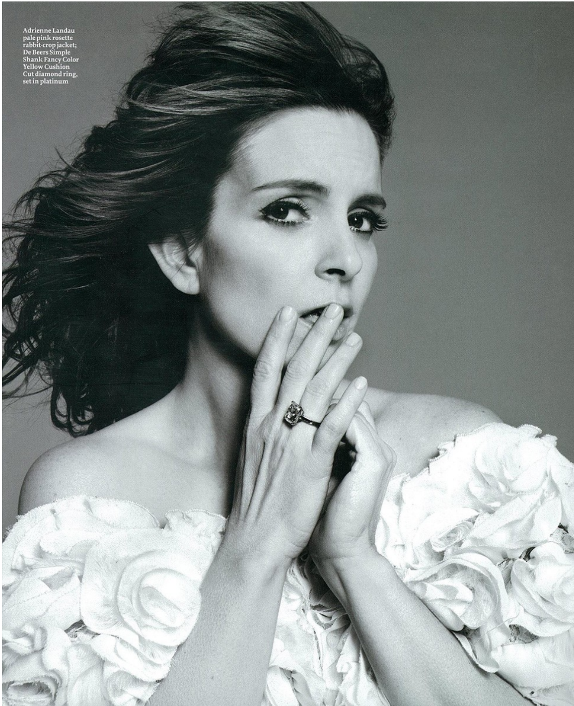
Adrienne Landau pale pink rosette rabbit crop jacket; De Beers Simple Shank Fancy Color Yellow Cushion Cut diamond ring, set in platinum