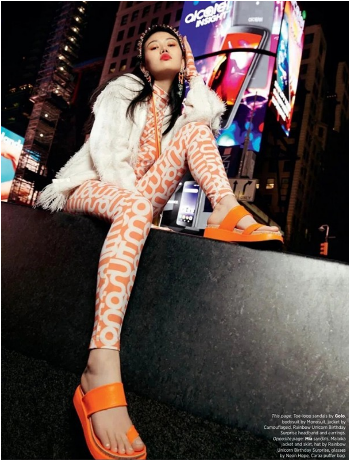
This page: Toe-loop sandals by Golo, bodysuit by Monosuit, jacket by Camouflaged, Rainbow Unicorn Birthday Surprise headband and earrings. Opposite page: Mia sandals, Malaika jacket and skirt, hat by Rainbow Unicorn Birthday Surprise, glasses by Neon Hope, Caraa puffer bag.