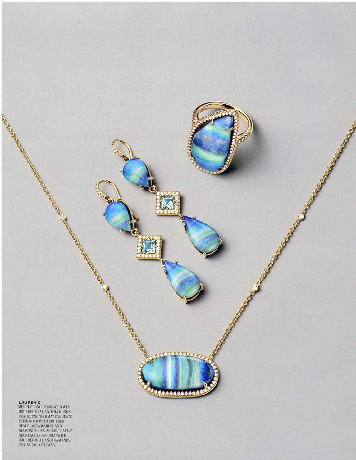
LAUREN K "MISCHA" RING IN 18K GOLD WITH BOULDER OPAL AND DIAMONDS. USA. $7,725. "GEMMA" EARRINGS IN 18K GOLD WITH BOULDER OPALS, AQUAMARINE AND DIAMONDS. USA. $8,330. "LAYLA" NECKLACE IN 18K GOLD WITH BOULDER OPAL AND DIAMONDS. USA. $5,940. OVL/BBG.