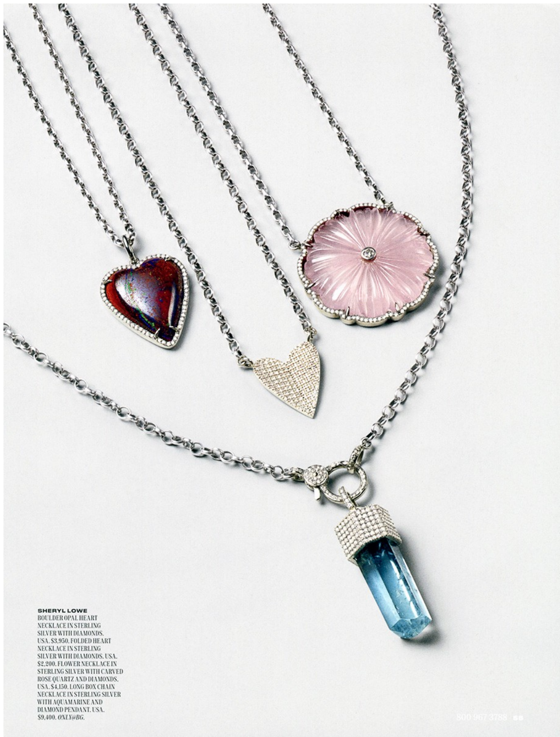
SHERYL LOWE BOULDER OPAL HEART NECKLACE IN STERLING SILVER WITH DIAMONDS. USA. $3,950. FOLDED HEART NECKLACE IN STERLING SILVER WITH DIAMONDS. USA. $2,200. FLOWER NECKLACE IN STERLING SILVER WITH CARVED ROSE QUARTZ AND DIAMONDS. USA. $4,150. LONG BOX CHAIN NECKLACE IN STERLING SILVER WITH AQUAMARINE AND DIAMOND PENDANT. USA. $9,400. ONLY@BG.