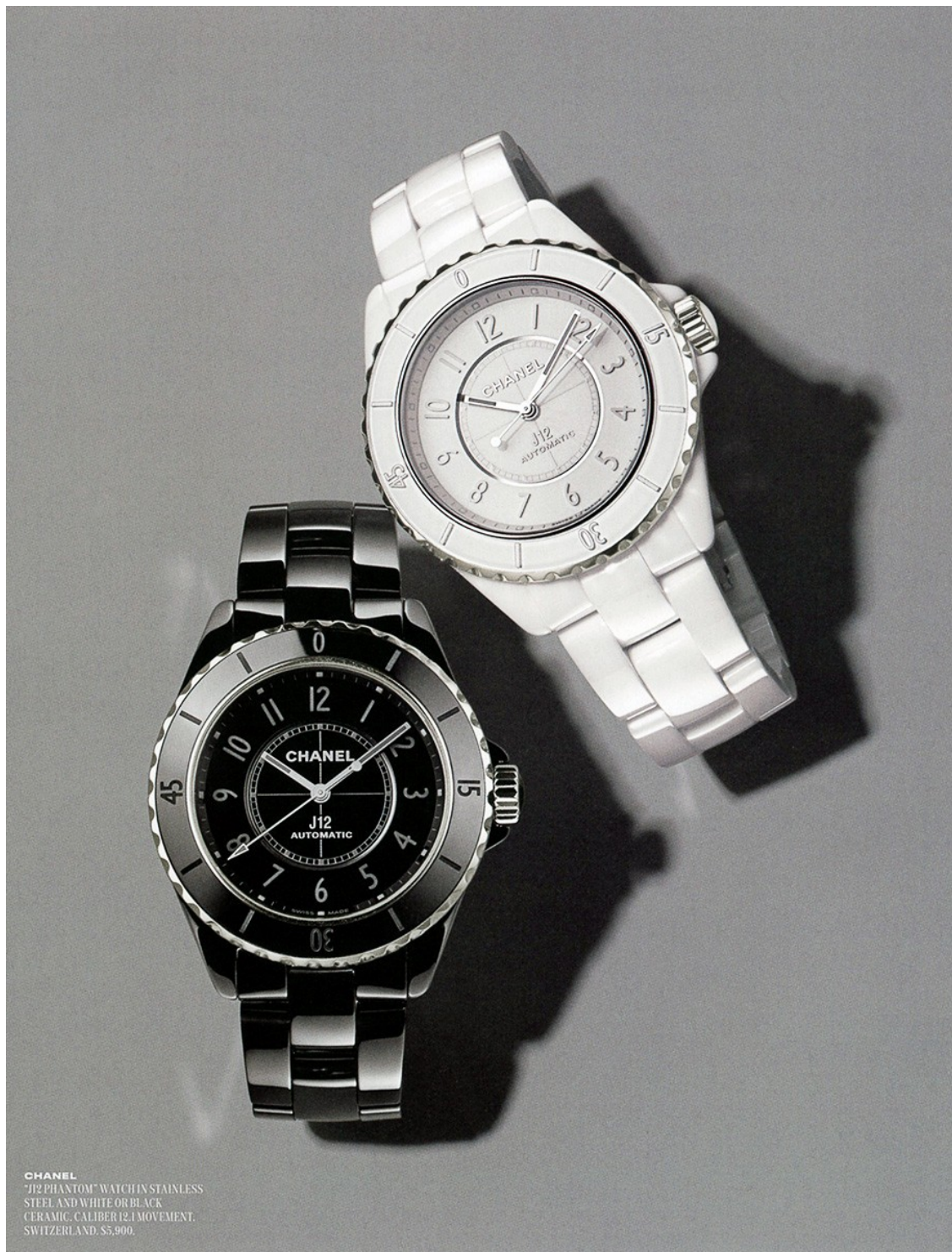
CHANEL "J12 PHANTOM" WATCH IN STAINLESS STEEL AND WHITE OR BLACK CERAMIC. CALIBER J12.1 MOVEMENT. SWITZERLAND. $5,900.